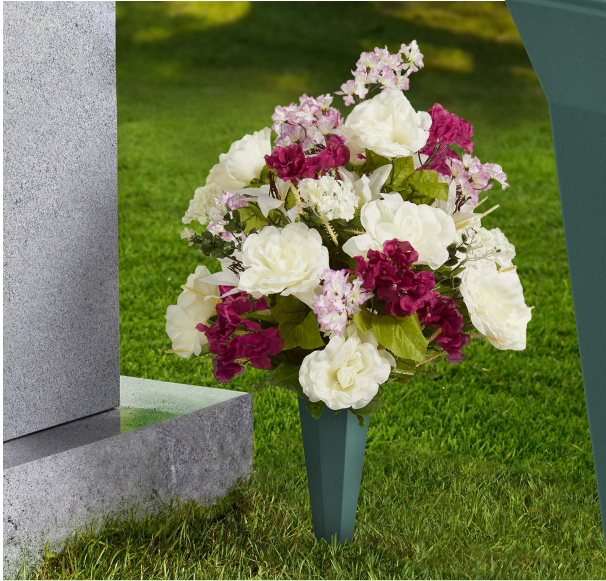
Updated color and modern matte finish